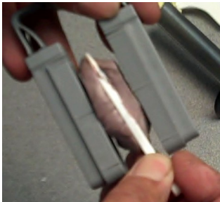
Invert pour over the impression